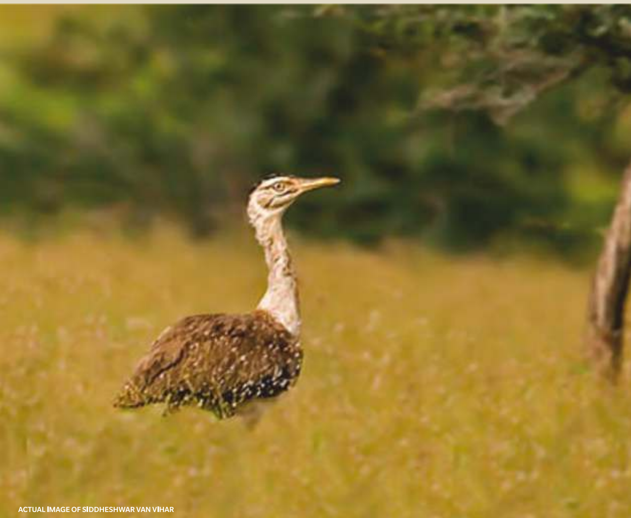
ACTUAL IMAGE OF SIDDHESHWAR VAN VIHAR