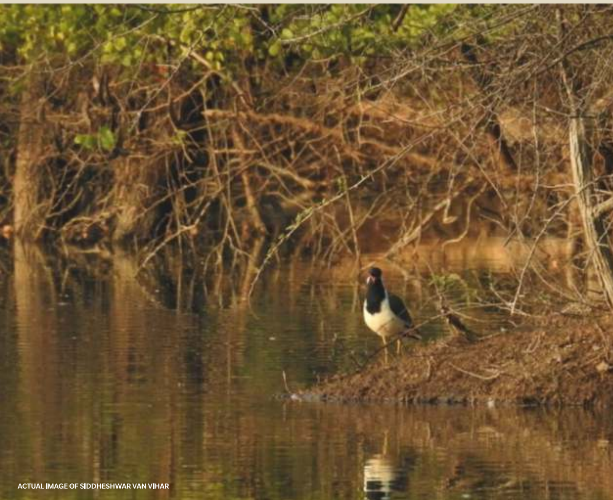
ACTUAL IMAGE OF SIDDHESHWAR VAN VIHAR